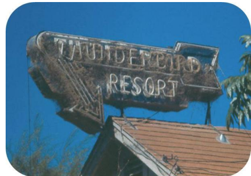
Adult Clear Lake gnats covering a resort sign.

County residents remember drifts of dead gnats a foot deep under lights. At times, the Clear Lake gnat swarms were so thick that drivers had to pull over every quarter-mile to scrape the dead gnats off their cars' headlights and windshield!