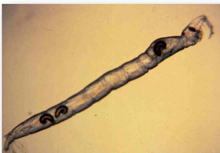
Clear Lake gnat larva

The Clear Lake gnat is still present in Clear Lake today, but its population is much smaller than it used to be. It is believed that the introduction of two fish species (Inland Silverside and Threadfin Shad) into Clear Lake have helped to keep it from reaching nuisance levels.